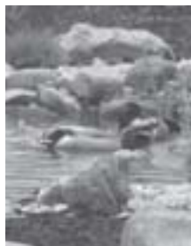
Two mallards swim in the pond.