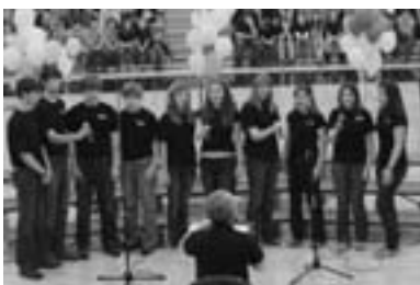
The audience was entertained by the Upper School Chorus.