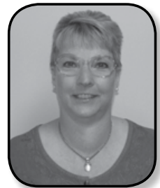
Miriam Kinworthy Technology & Media Center