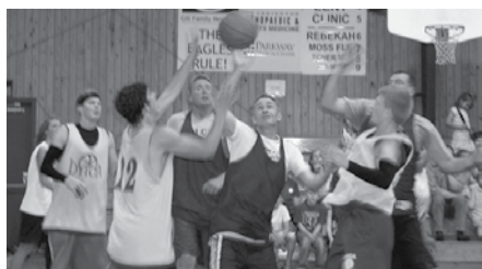
Cookout and Staff vs. Senior Basketball Game Monday, April 20, 1:45 pm.