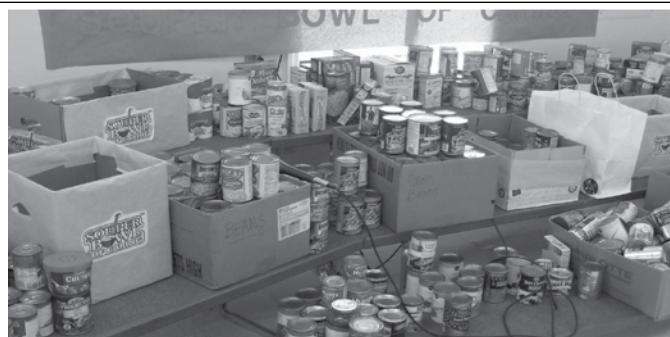
DHCA Beta Club sponsored a week of "Souper Bowl of Caring". More than 1,000 cans of food were donated to the Neighborhood Christian Center which will be distributed to families in the area.