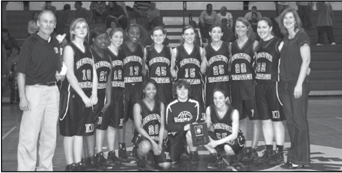
Varsity Girls - Area Runner-Up