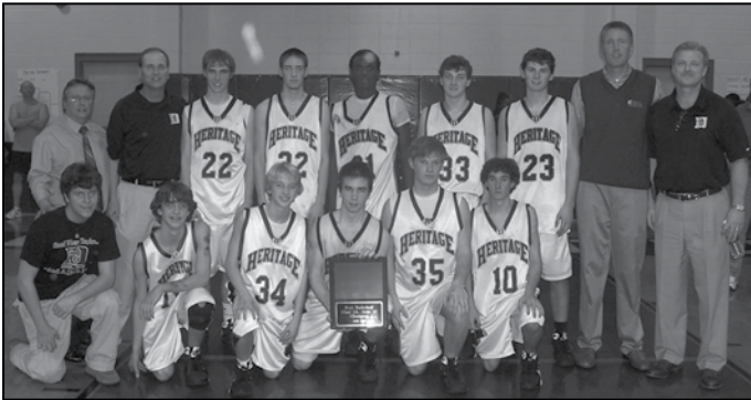
Varsity Boys Area & Subregional Champions and Regional Runner-Up